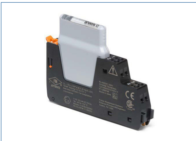
CHARM and Terminal Block.

Plug and Play I/O: The DeltaV CIOC has been designed for ease of use, both in physical installation and its software tools. Components snap together with secure DIN-rail latches and interlocking carrier connectors. Attach a series of 96 I/O channels to a DIN-rail in a matter of minutes. Insert the CHARMs and auto sense the node to create the I/O definition automatically in your DeltaV configuration database. CHARMs use a self keying system to automatically set a channel for a specific CHARM type. Users cannot mistakenly insert a CHARM into the wrong terminal block. Assign all, one or any number of channels to a controller with a simple click or drag and drop.