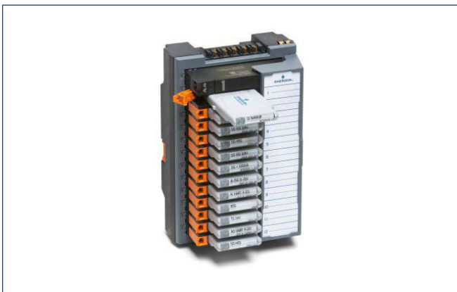
CHARM Latch mechanism.

CHARMs can be partially ejected to a locked position that disconnects the field wiring from the system to perform field maintenance actions or to remove power to a field device. Activating the CHARM latch ejects the CHARM to the detent position. Closing the latch locks the CHARM in place and isolates the field wiring for field work.