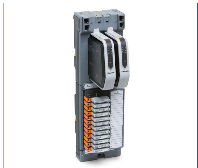
CHARM I/O Card (CIOC) with CHARMs.